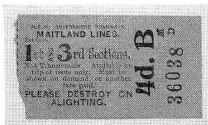
Fare ticket used for the through journey at Maitland between 18th June, 1917, and 31st December, 1926. Colour: Salmon.