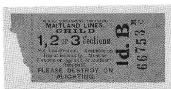
Fare ticket used for children on any single journey on the Maitland lines. Colour: Brown.