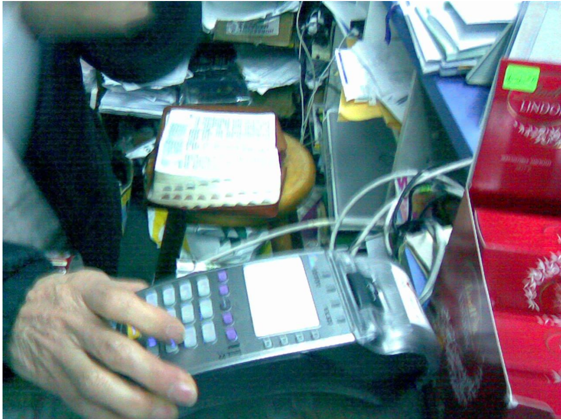
Topping up at an Opal agent.

Opal top up/daily ticket machines from 2015.