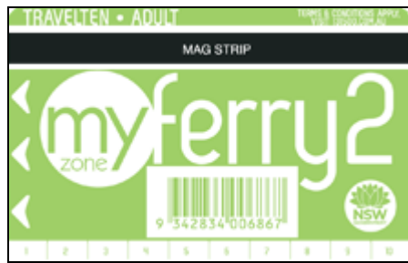
MF1-2 Single & TravelTen Titled "My Ferry" for Transit Shop

There were second printings of some types (different barcodes & modified designs).